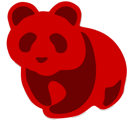
Full shade in PP (0.1%)

Cinilex® Red SR4C is a highly transparent, bluish red, FDA approved pigment, suitable for Polyolefin non warping and food packaging applications, PVC films and engineering plastics, such as Polyamide 6 and Polyamide 66.