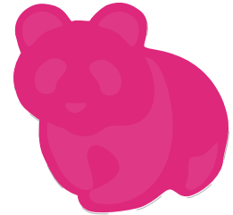
1/3 ISD in PP (0.21%+1% TiO 2 )