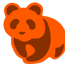
Full shade in PP (0.1%)

Cinilex® DPP Orange SJ1C is a highly opaque, high colour strength, lightfast and saturated orange pigment for use in polyolefin film applications. This pigment is the most cost effective organic pigment to be used when formulating away from Molybdate Orange based formulations.