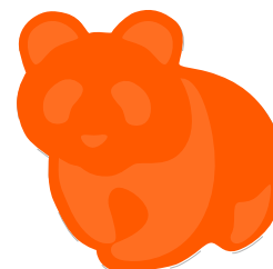
1/3 ISD in PP (0.30%+1% TiO 2 )